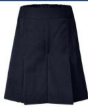
Navy polyester/viscose culotte