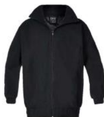
Microfibre jacket embroidered with school logo