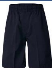
Navy polyester/viscose shorts