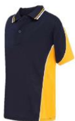
Navy and gold polo with white trim embroidered with school logo