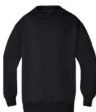
Sloppy joe embroidered with school logo