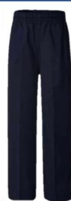
Polyester/viscose long pants